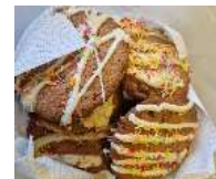
Charlie in Ladybirds