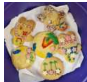
Ester in Dragonflies