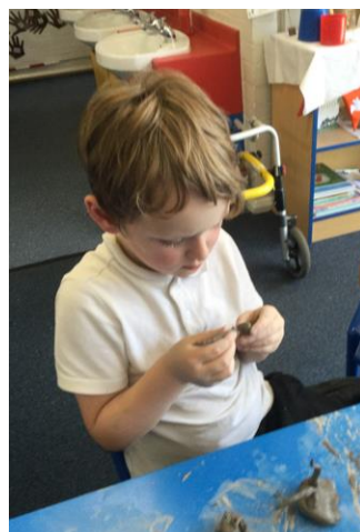
Year 1 used clay and had to persevere to make animal sculptures.

'God is my strength, in whom I trust.' Psalm 18