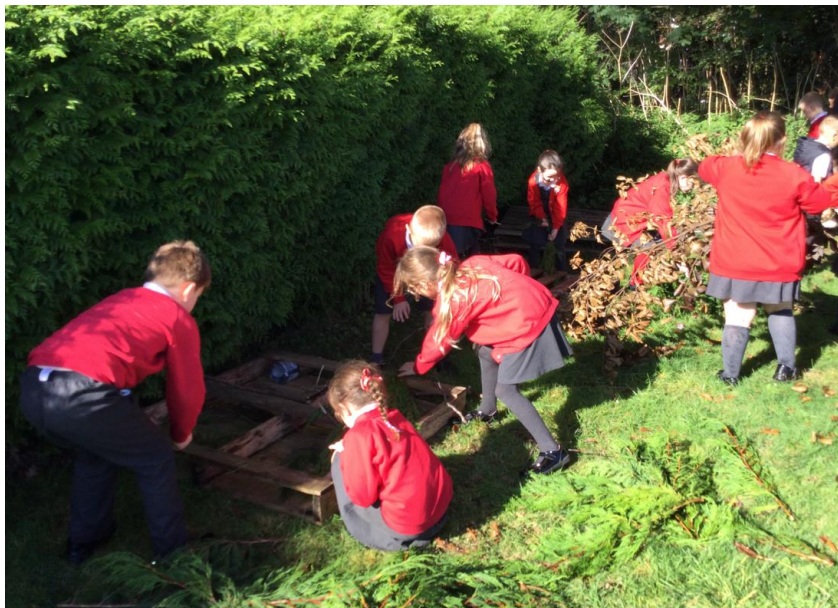
Children in Year 2 persevering to enable them to make a bug hotel.