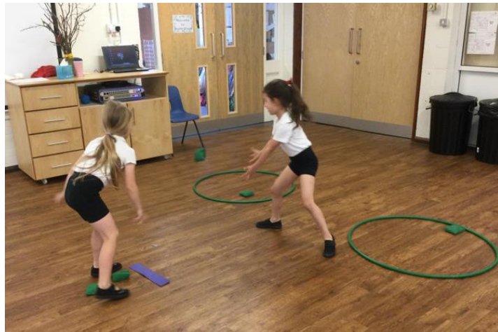
The children in year 1 persevered with their throwing and catching skills