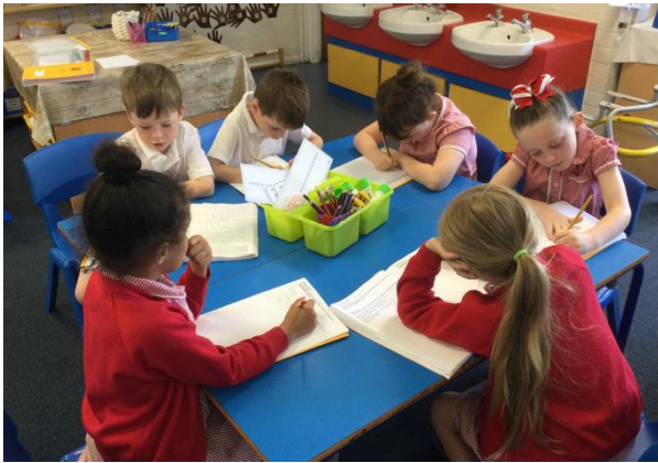
The children in year 1 persevered with their maths work.