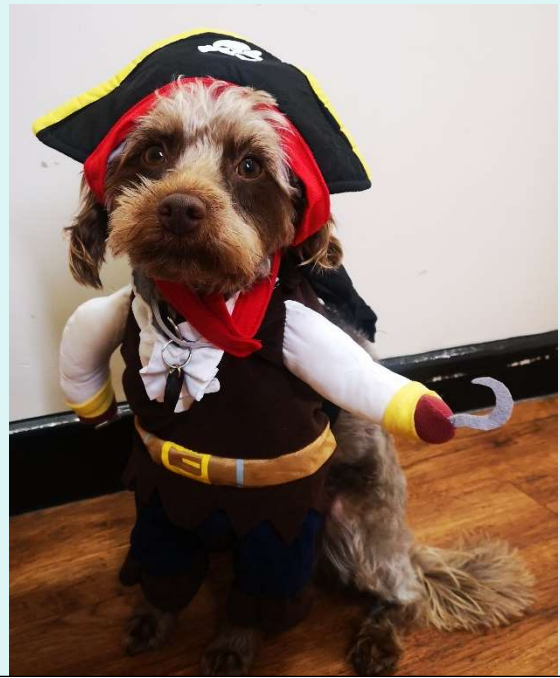
Eddie's special talent was looking super cute in a pirate costume!