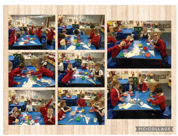
God gave Jesus to us as a gift. We made gifts for people at home.