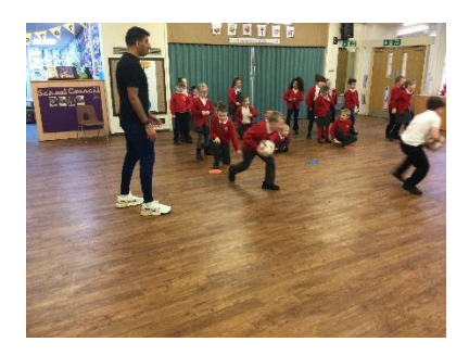
'God is my strength, in whom I trust.' Psalm 18